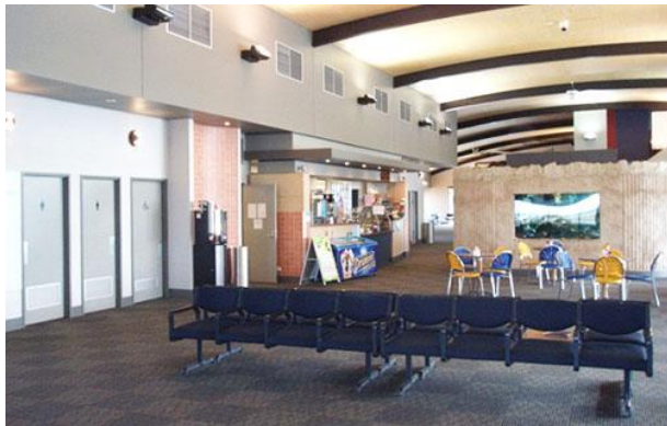
Figure 3 Airport lounge facilities

Guide and assistance animals are allowed in the terminal building. Passengers travelling with a guide or assistance animal are encouraged to provide information to the airline when making a booking to allow for appropriate seating arrangements.