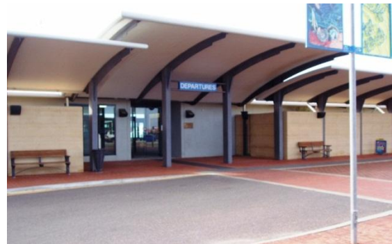
Figure 1 Drop off and pick up area in front of the terminal entrance.

Passengers are encouraged to liaise with the airline at the time of booking for any direct assistance requirements between kerbside and the terminal.